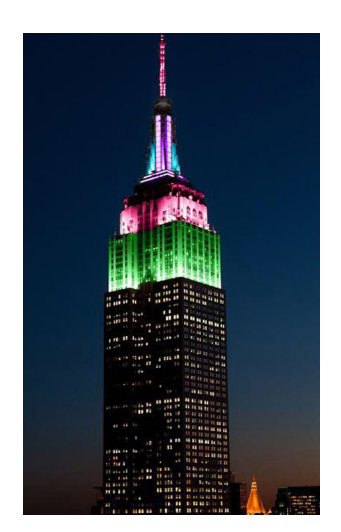
Empire State Building

Today, hundreds of buildings, monuments, landmarks, and homes across the United States participate in Light Up for Rare and we hope you will join in. Read on for the simple steps to join the light up initiative.